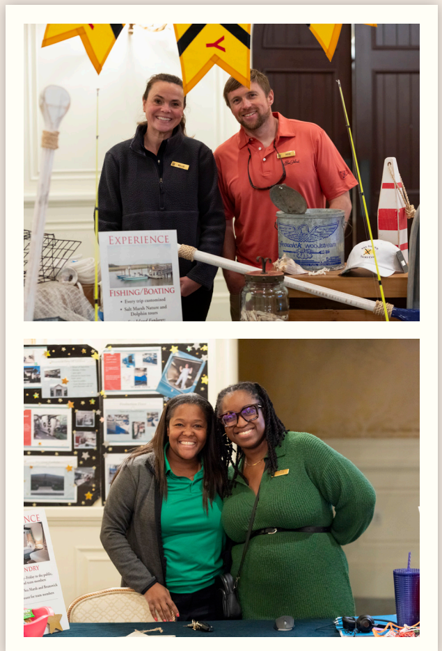
Sea Island team members joined together to introduce students to the resort's many career paths.

For more information about Communities in Schools Glynn County and their mission to empower local youth, please visit cisofglynn.org .