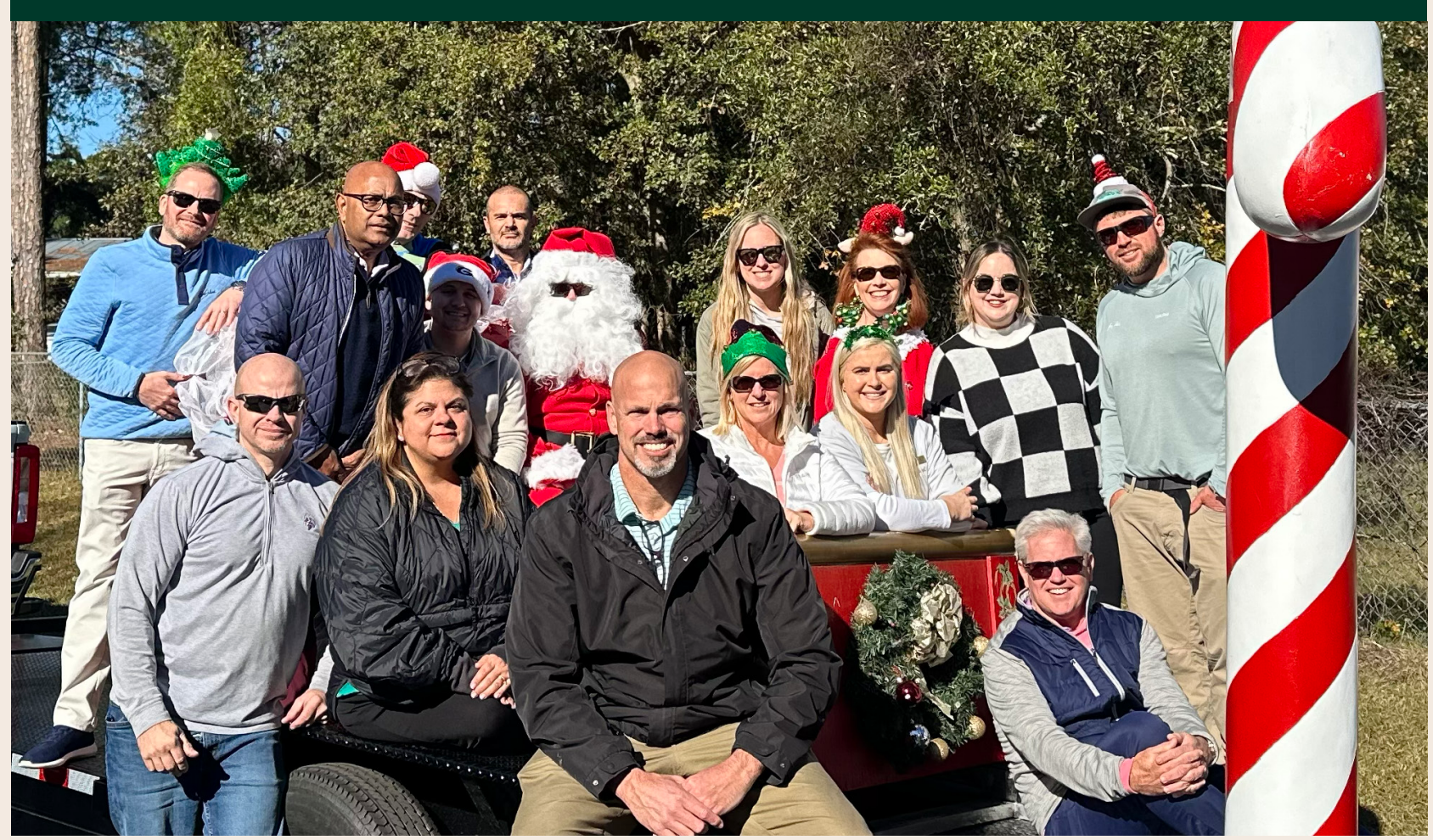
Team members from America's Second Harvest of Coastal Georgia and Sea Island joined in the 2023 Holiday Toy Drive.